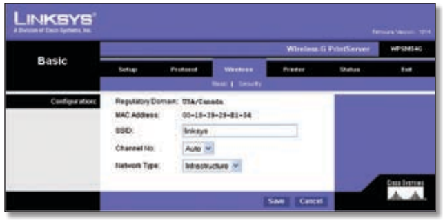
Wireless > Basic

This screen allows you to change the PrintServer's basic wireless settings.